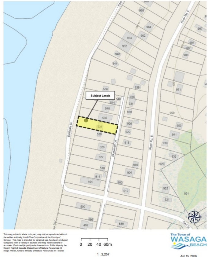
Wasaga Beach - Web Map

Note: Alternative formats available upon request.